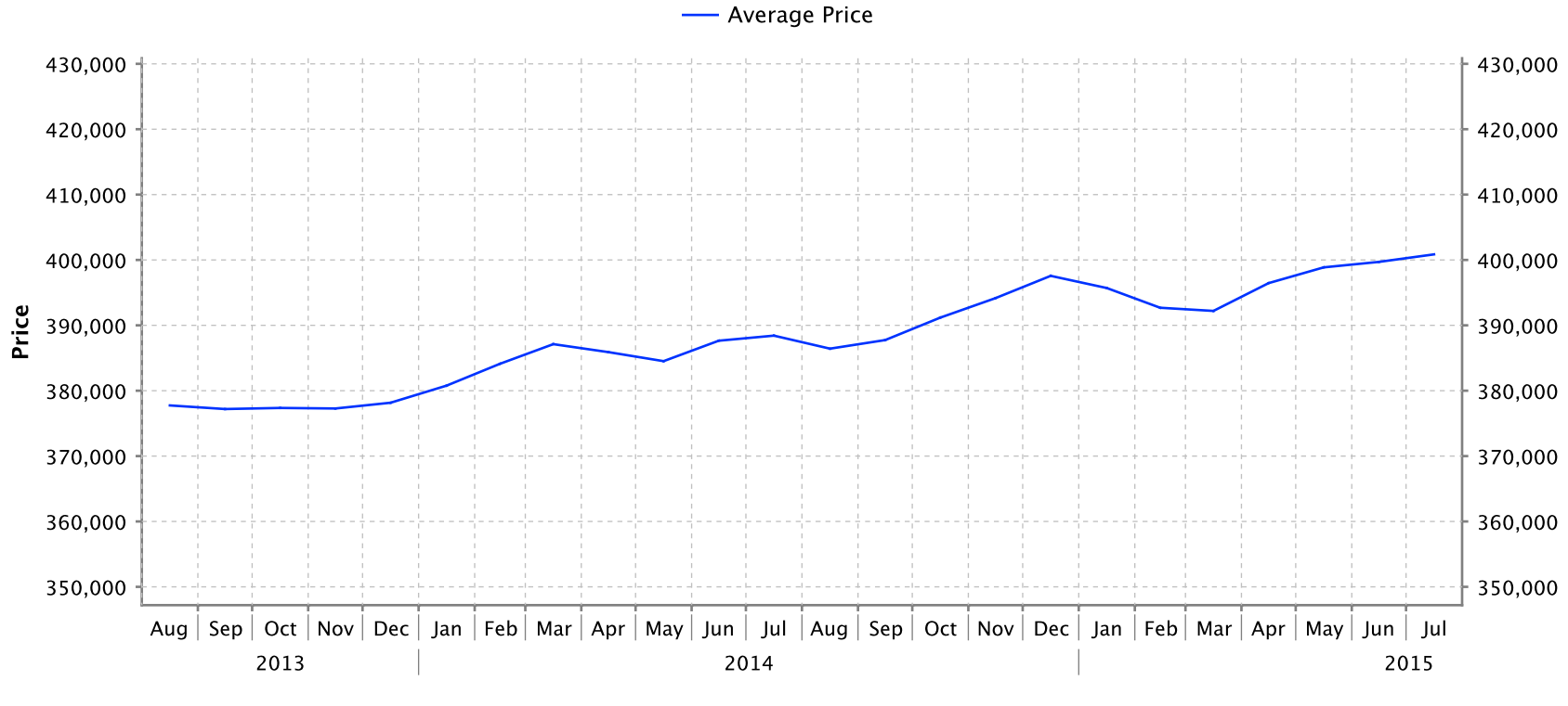
NOTE: Figures are based on a "rolling total" from the past 12 months - i.e. 12 months to date instead of the calendar "year to date".